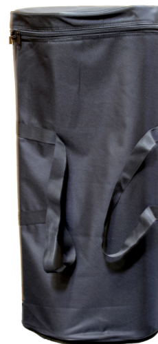
Black Travel Bag