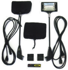
*Optional 150 watt halogen lights