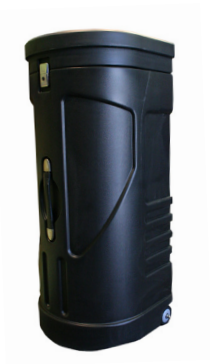
Half Hard Case is optional.

Graphic Turnaround Time is 2 business days for up to 2 sets