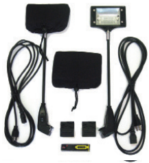
*Optional 150 watt halogen lights